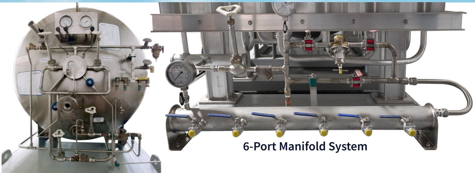
6-Port Manifold System

Cyl-Tec, Inc. 971 W. Industrial Dr. Aurora, IL 60506